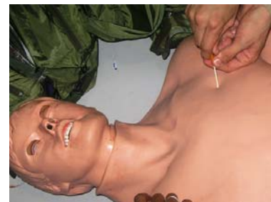
Critical Care Procedures